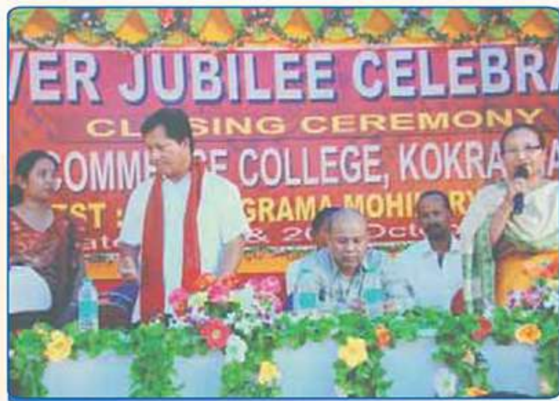
Moment of Silver Jubilee Celebration of Commerce College, Kokrajhar