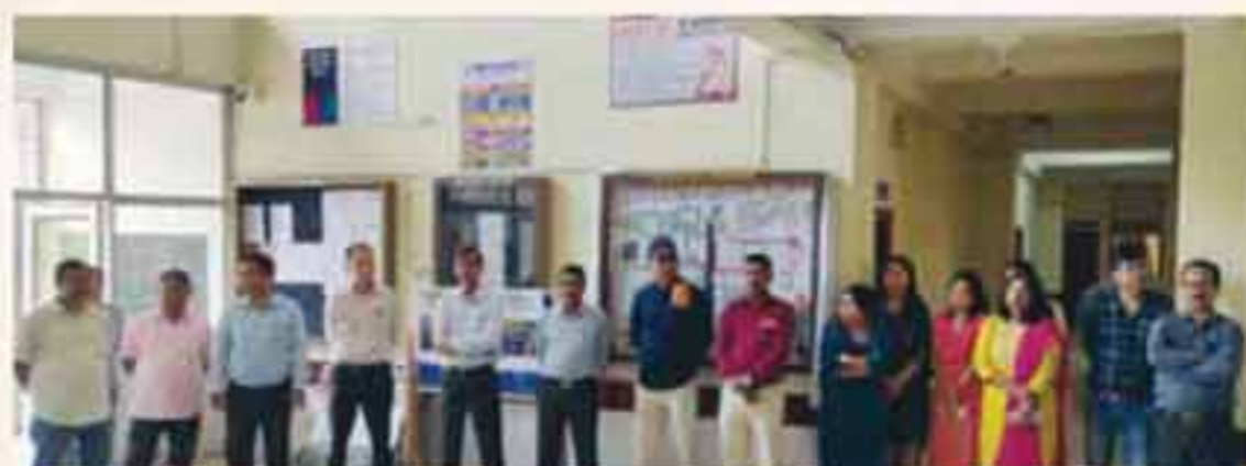
Observance of Birth Anniversary of Gurudev Kalicharan Brahma