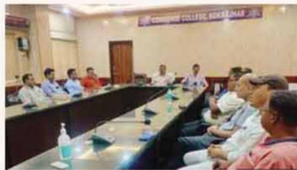
Staff Council Meeting