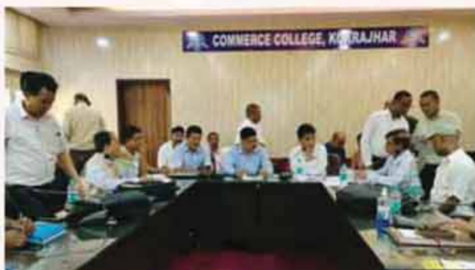
Meeting of B.T.R. Administration with B.T.R. Degree Colleges for Preparation of Roster