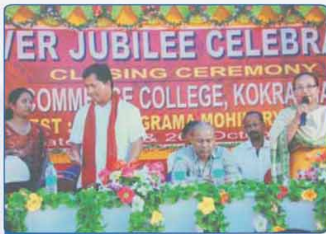
Moment of Silver Jubilee Celebration of Commerce College, Kokrajhar